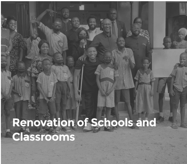
Renovation of Schools and Classrooms