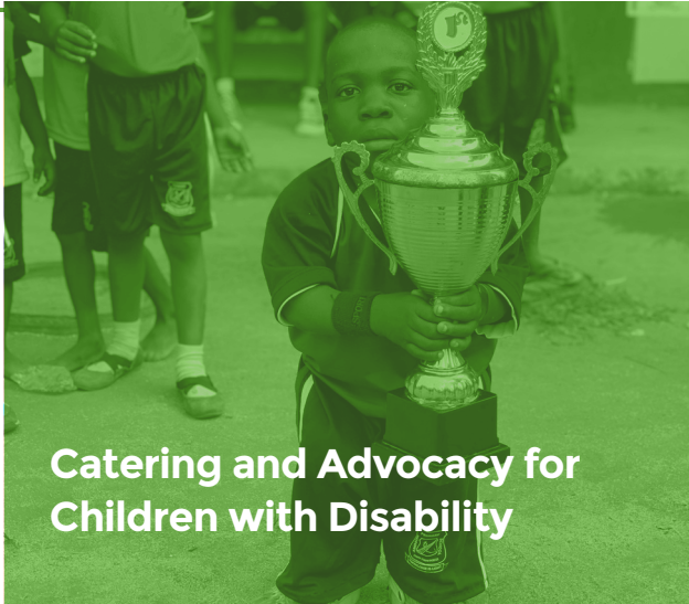
Catering and Advocacy for Children with Disability