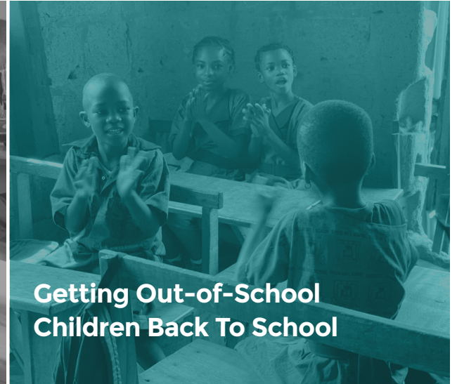
Getting Out-of-School Children Back To School