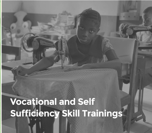
Vocational and Self Sufficiency Skill Trainings